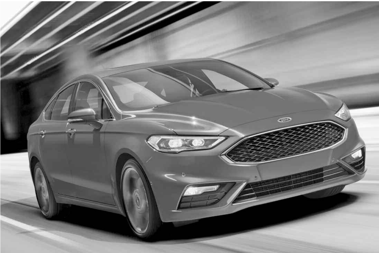
Ford is adding serious EcoBoost® muscle to its Fusion sedan in an all-out assault on more expensive German sport sedans.