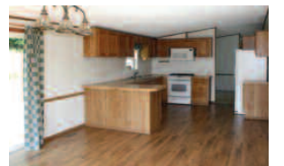
2268 ECHO LANE • EAST JORDAN