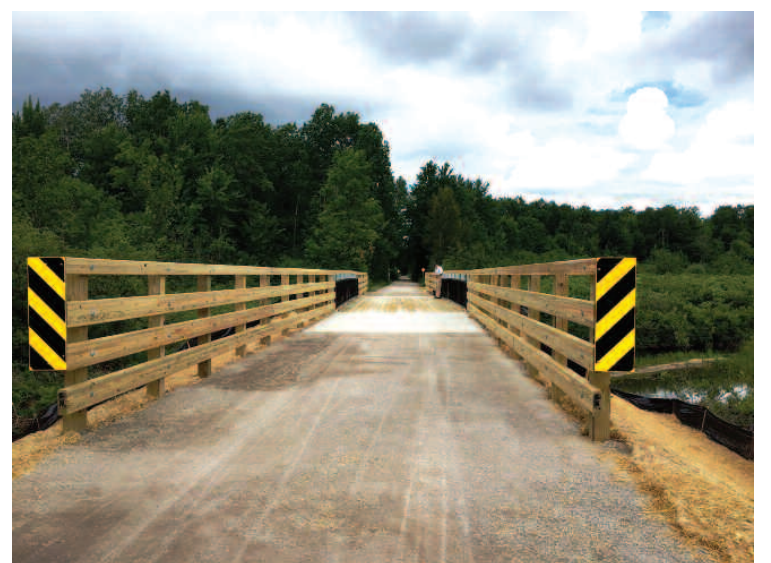
The North Western State Trail is 32 miles from M-119 in Petoskey to the trailhead in downtown Mackinaw City. The Carp Lake River Bridge replacement, shown here, was the last part of a recent trail improvement project.

A ribbon-cutting celebration for the North