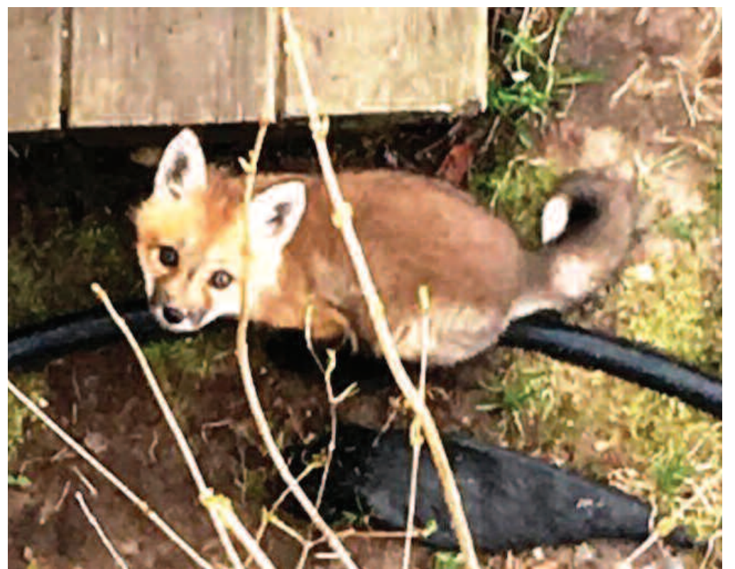
ABOVE: This adorable baby fox was part of a family that denned under a deck in Petoskey.