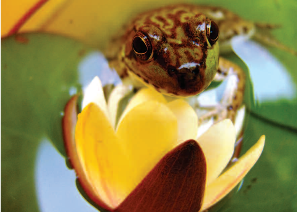
ABOVE: A green frog hugs a white water lily at Spring Lake Park in Petoskey.

It has been a sensational and sunny summer "Up North." Some photographic examples: