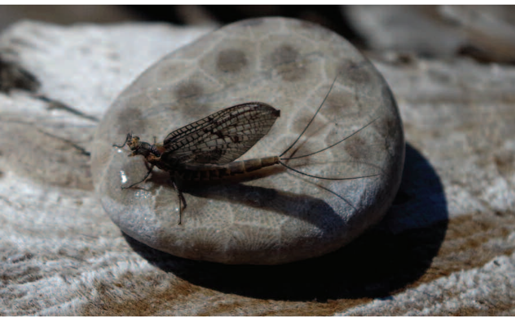
LEFT: Two Michigan "mascots:" A brown drake mayfly (aka fish fly) perches on top of a Petoskey stone at a Lake Michigan beach near Charlevoix (PATRICK BEVIER).